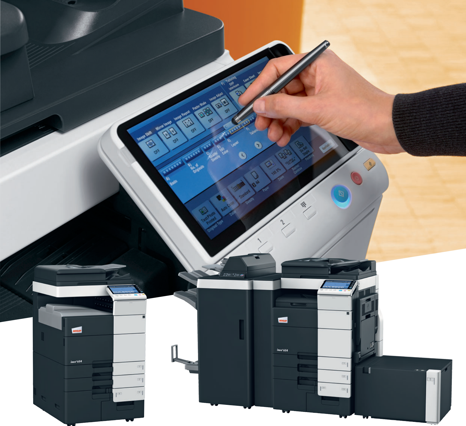
ineo+ 654 with output tray (OT-503)